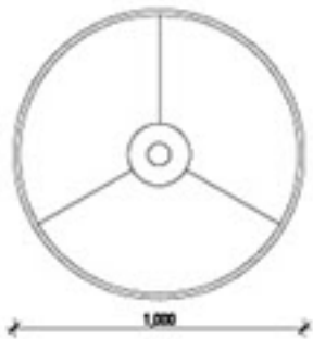
01 PLAN - SUSPENDED DRUM LIGHT