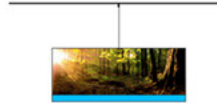
03 COLOURED ELEVATION - SUSPENDED DRUM LIGHT